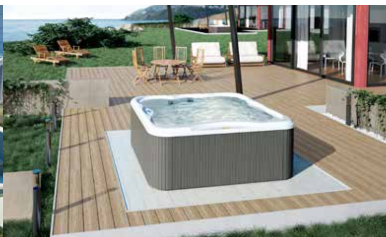
freestanding (silver wood)